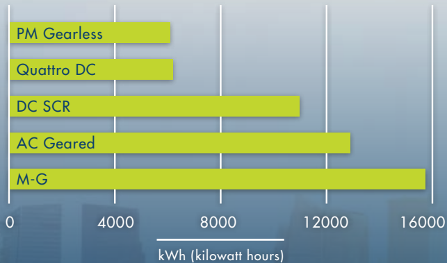
POWER CONSUMPTION BY CONTROL TYPE

*Comparison based on 500ft/min. elevator, 2200 lb, 13 floors and 301,000 starts per year